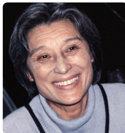
Dr Han Suyin