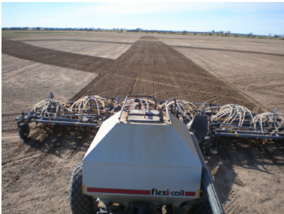
Preparing the message

The attached photos of the farm were taken over the last 10 or 12 years. Grain is planted at seeding time and as you can see it grows nice and green. The students tell us that it gives them a warm feeling in their hearts as they fly over the wheat fields. The word " Ping An " in Chinese characters was chosen by them for us to write. There was a mistake once when An Ping was written. They said it didn't matter because classical Chinese was read backwards.