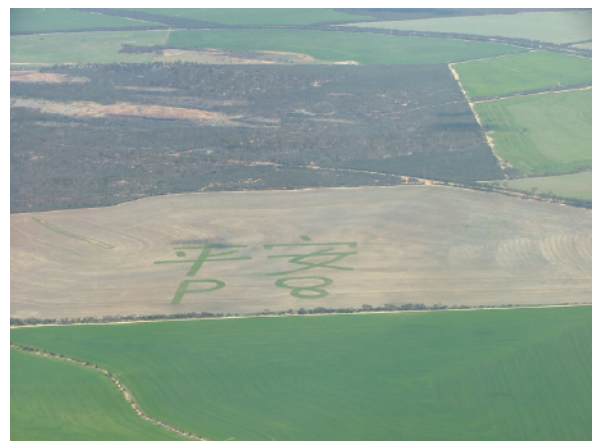
Ping An or An Ping