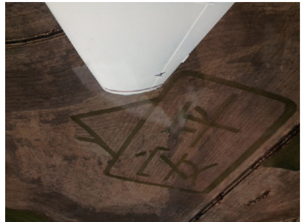
A view in Winter