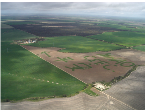
This way to the farm