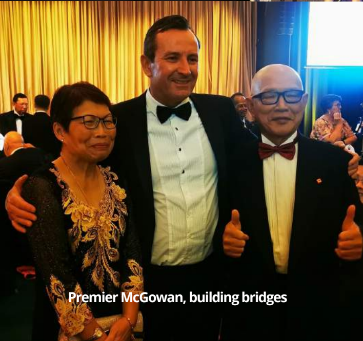
Premier McGowan, building bridges