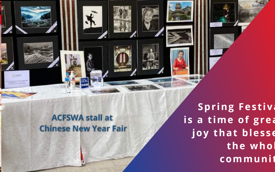
ACFSWA stall at Chinese New Year Fair

Spring Festival is a time of great joy that blesses the whole community